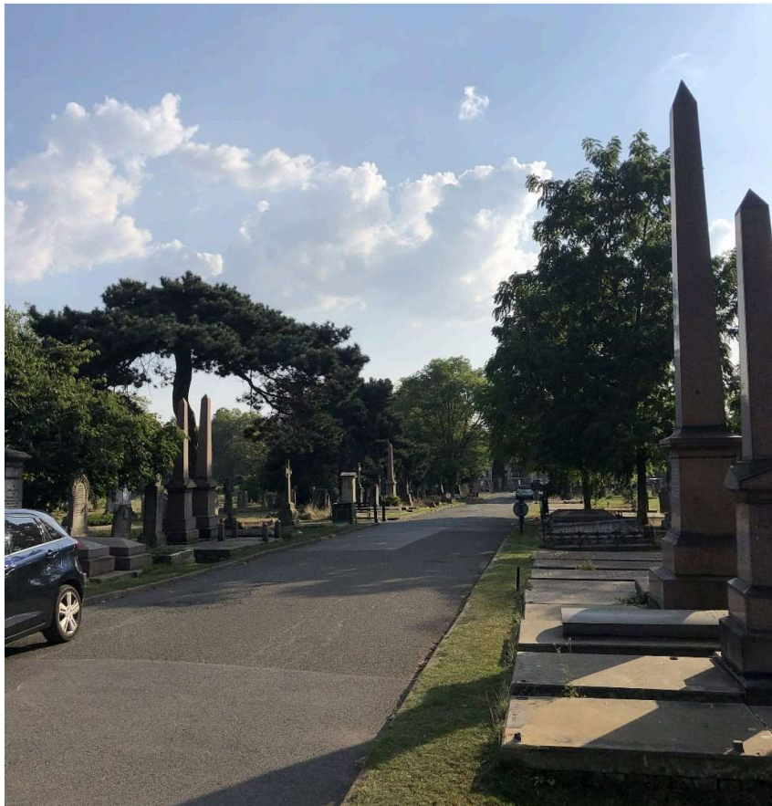
PADDINGTON OLD CEMETERY: A popular dog-walking site in the area.

At the time of writing, nearly 200 comments have been made on a post on community social media platform Nextdoor, indicating the debate and confusion which the supposed rule has caused.